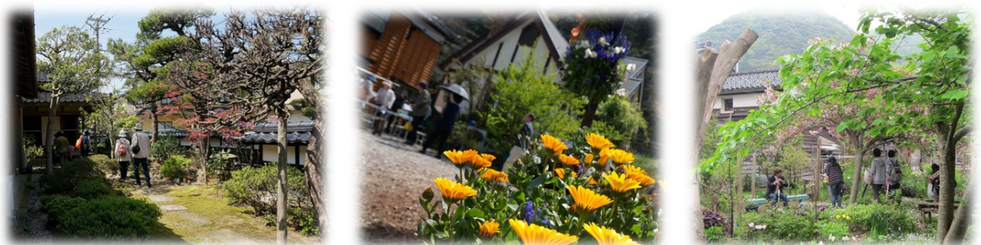
These pictures are 'Kundani Open Garden' last spring

On April 21 st , these gardens will be open to the public, so you see numerous beautiful flowers & plants and interact with the gardens' owners. In addition to the gardens, this tour includes various activities including tea ceremony and sushi making.