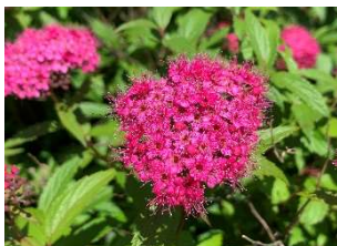
⑰ Spiraea japonica Common shrubs in gardens and parks. Flowers are red or white, and Genpei species bloom both.