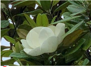
① Magnolia grandiflora var. lanceolata Often used for road trees. Evergreen and large flowers bloom.