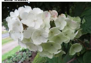
⑬ Hydrangea quercifolia 'Snow Queen' Native Hydrangea in America, with fragrance, bloom earlier than Japanese Hydrangea.