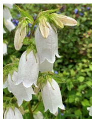
②② Campanula punctata var. punctata Put a firefly in the flower and it looks like a lantern.