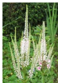
②⑤ Veronicastrum virginicum Nice view after blooming too.