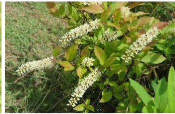
⑫ Itea virginica Shrubs, native to North America. It fits in both Japanese and Western style. Used for tea ceremony.