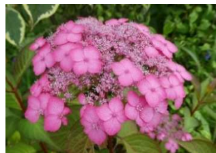
⑯ Hydrangea 'Asian Beauty' Hydrangea serrata hybrid, not so tall. The beautiful copper leaves.