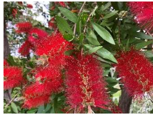
⑩ Callistemon speciosus Also called 'Scarlet Bottlebrush'. Flowers are red or cream. Native to Australia. It is also called brush tree because it resembles a brush.