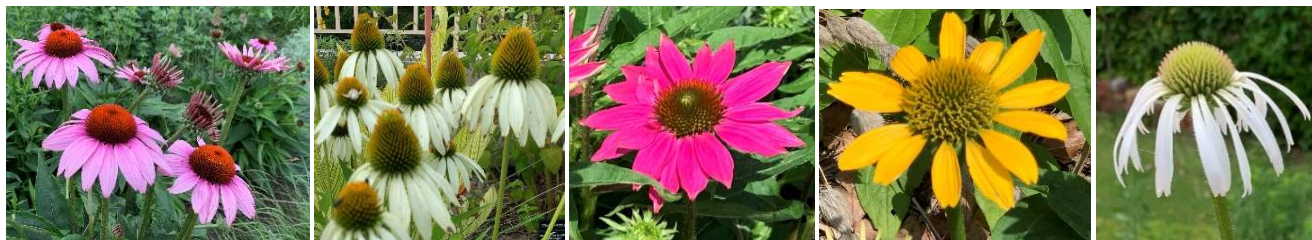
②① Echinacea Echinacea , a typical summer perennial plant that is an essential part of the Perennial Garden, is beginning to bloom.