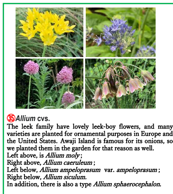
③⑤ Allium cvs.

The leek family have lovely leek-boy flowers, and many varieties are planted for ornamental purposes in Europe and the United States. Awaji Island is famous for its onions, so we planted them in the garden for that reason as well.