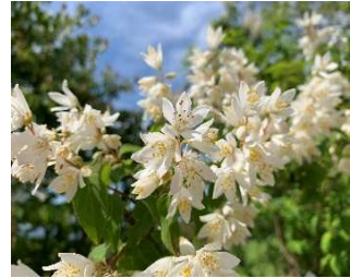
⑧ Deutzia crenata It grows wild in the mountains and fields of Japan. Pure white flowers from May to June.