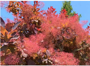
⑨ Cotinus coggygria Also called 'Smoke Tree'. What look like smoke are not flowers but hair attaching with flower stems of sterile flower. There are red, pink, and white.