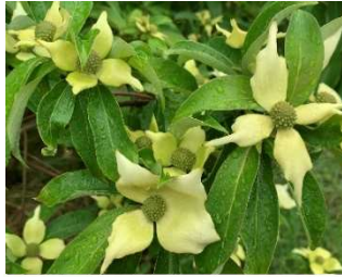
⑦ Cornus hongkongensis 'Gekkou' Native to China, evergreen, a popular specie. Gekkou means moonlight .