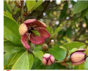
④ Magnolia figo Also called 'Banana Shrub'. You can smell banana scent from the evening. Up to the beginning of the month.