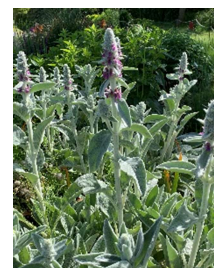
②⑦ Stachys byzantina Leaves feel nice to the touch. Also called 『Lamb's Ear』.