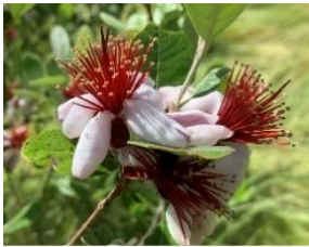
⑪ Acca sellowiana Also called 'Pineapple Guava' or 'Fijioa'. Fruit trees native to Central and South America. Beautiful posture and flowers.