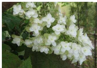
⑭ Hydrangea quercifolia 'Snow Flake' Double-flowered variety of ⑬. Flowers last long.