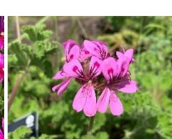
③③ Pelargonium capitatum