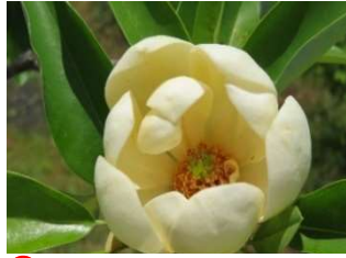
③ Magnolia virginiana Flowers and leaves are a bit smaller than Magnolia grandiflora . Semi-evergreen to deciduous, and good fragrance.