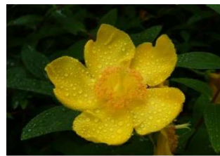
Hypericum 3 types ⑱⑲⑳ from left, ⑱ Hypericum 'Hidcote', ⑲ Hypericum calycinum , ⑳ Hypericum androsaemum . The Hypericum family shrub, in which there are Hypericum monogynum and Hypericum patulum . Fruit of ⑳ is also an object of appreciation, and there are a lot of variety of colors, good for cut flowers.