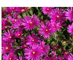
③② Delosperma cooperi