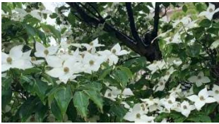
⑤ Cornus kousa It grows naturally in the fields and mountains of Japan. The white petals look like bracts. Also called 'Japanese Dogwood'.