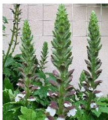
②③ Acanthus mollis Huge lodging plant.