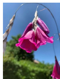
②⑥ Dierama pulcherrimum Long flower stalks emerge from the awn- like plant. Also called 『Angel's Fishing Rod』.