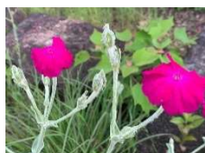
②⑨ Lychnis coronaria