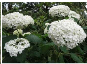
⑮ Hydrangea arborescens 'Annabelle' Native to America, easy to care. It is becoming popular.