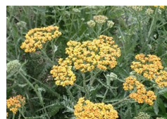
②⑧ Achillea millefolium 'Terra Cotta'