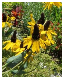
②④ Rudbeckia maxima Tall, large lodging plant. Easily fallen down.