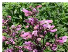
③⑩ Penstemon digitalis