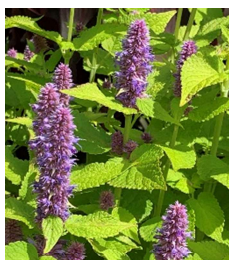
③① Agastache rugosa 'Golden Jubilee'