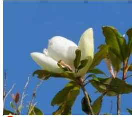
② Magnolia grandiflora 'Timeless Beauty' One of ornamental plants. The edge of leaves looks like waves. Flowers last long.