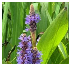
⑭ Pontederia cordata An aquatic plant native to North America. The bluish flower color looks refreshing.