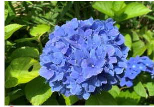
③ Hydrangea macrophylla f. normalis 'Enzindom' An old variety with a beautiful dark blue color.