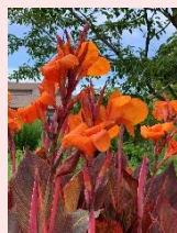
Color leaf plant