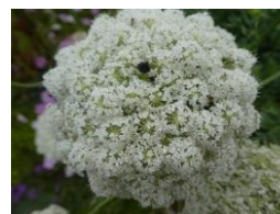
18 Daucus carota