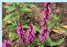
Salvia 'New Dimension'