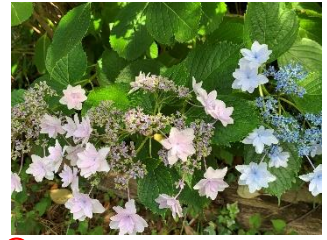
④ Hydrangea macrophylla f. normalis 'Sumida-no-hanabi' Hydrangea macrophylla (Lacecap Hydrangea) looks like big fireworks. "Hanabi" means fireworks in Japanese.