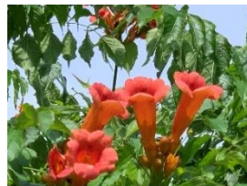
⑩ Campsis radicans Hardy climbing wood.