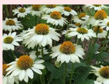
Echinacea purpurea «white color»