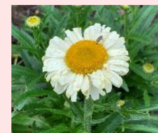
Leucanthemum x superbum