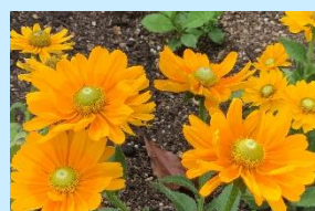
Rudbeckia hirta 'Prairie Sun'