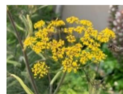
17 Foeniculum vulgare 'Purpureum'