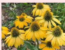
Echinacea purpurea 'Prairie Blaze'