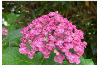
② Hydrangea macrophylla f. concavosepala Decorative flowers become thick and bowl-shaped.