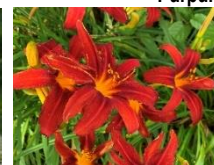
19 Hemerocallis cvs. Orange, yellow etc. There are many varieties.