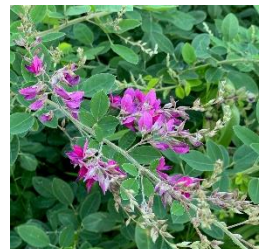
⑫ Lespedeza thunbergii Lespedeza is common in northern part of Honshu, the main island in Japan. Often used in horticulture.