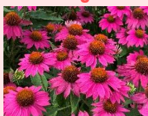
Echinacea purpurea 'Pink Swan'