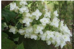
⑥ Hydrangea quercifolia 'Snow Flake' Double-flowered variety of ⑤. Flowers last long.