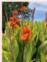
Canna 3 varieties