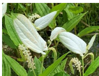
⑮ Saururus chinensis Japanese name 「Hangeshou」 is named after "hangeshou" as one of the seventy-two climates, around July 2nd. Around this time, leaves closest to flowers turn into white and back into green after flowering. 「Hangeshou」 can be divided into two part, han: half and geshou: makeup. That is why, this is also called 「half-makeup」. A member of the Saururaceae family, it has a distinctive odor.