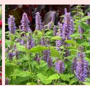
Agastache rugosa 'Golden Jubilee'