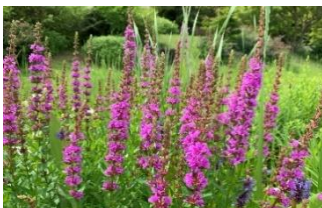
⑬ Lythraceae salicaria A perennial plant that grows near water, which has denser clusters of flowers than Lythrum anceps . This is invasive, so needs to be looked after.