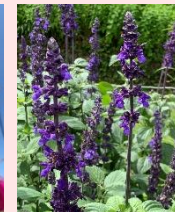
Salvia 'Big Blue'