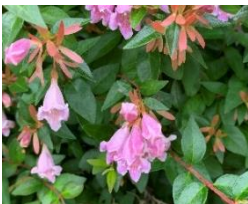
⑨ Abelia x grandiflora Left: Abelia x grandiflora 'Edward Goucher', having pink petals. Right: Abelia x grandiflora 'Kaleidoscope', having yellow variegated foliage.