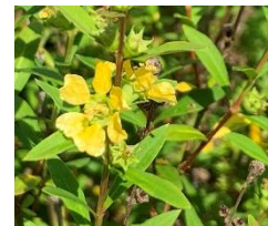
⑪ Heimia myrtifolia Small flowering tree native to Brazil