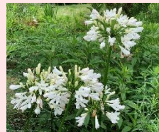
Agapanthus africanus «white color»