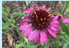
Gaillardia 'Grape Sensation'