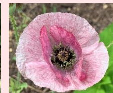
※ Papaver rhoeas 'Mother of Pearl'