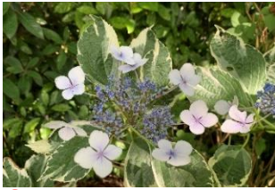
① Hydrangea macrophylla f. variegata Hydrangea macrophylla (Lacecap Hydrangea) with variegated leaves.

【Hydrangea Family】 We don't have many hydrangeas on our campus, but we do see some varieties of the Japanese Hydrangea macrophylla family. Colors range from blue to pink depending on location. The names of the unmarked variety are unknown.