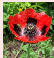
※ Papaver commutatum 'Ladybird'