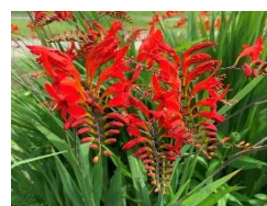
16 Crocosmia cv.