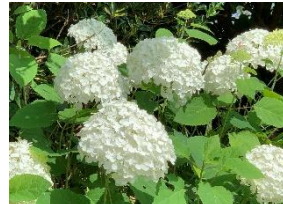
⑦ Hydrangea arborescens 'Annabelle' Native to America, easy to care. It is becoming popular.