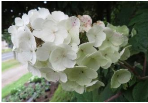
⑤ Hydrangea quercifolia 'Snow Queen' Native Hydrangea in America, with fragrance.