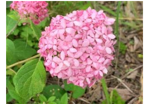
⑧ Hydrangea arborescens 'Pink Annabelle' An improved variety of Annabelle. Flowers are small.