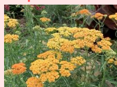
Acheille millefolium 'Terra Cotta'