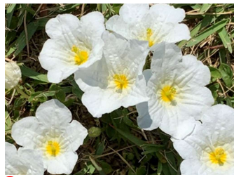
②① Nierembergia repens With short stem, it looks like flowering directly from the ground.