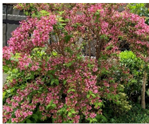
⑨ Weigela hortensis It grows wild in the fields and mountains of Japan and blooms around the time of rice planting.