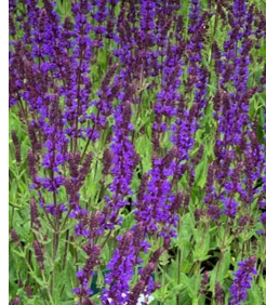
②⑥ Salvia nemorosa 'Caradonna' Lodging plants with long-lasting flowers.