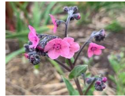
②⑨ Cynoglossum amabile 'Memory Pink' An annual plant similar to Myosotis scorpioides (Forget-me-nots), but large.