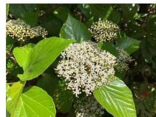
⑭ Viburnum japonicum An evergreen flowering tree that grows wild mainly in the forests of western Japan. Beautiful red fruit in autumn.