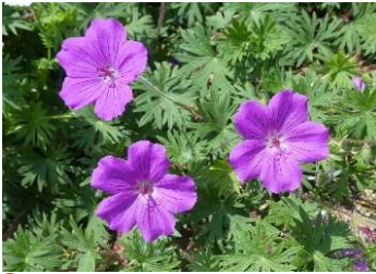
②⑩ Geranium 'Tiny Monster' Garden plants, based on Geranium sanguineum .