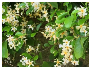
⑱ Trachelospermum asiaticum A climbing tree commonly found in the fields and mountains of Japan. Poisonous in the Apocynaceae family.