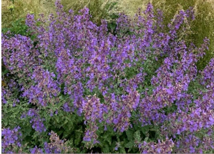
②④ Nepeta × faassenii 'Junior Walker' More compact horticultural varieties than conventional ones.