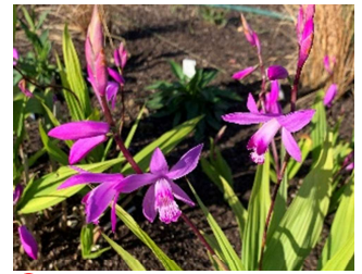
②③ Bletilla striata A hardy, well-growing perennial plant that is rare in the orchid family.