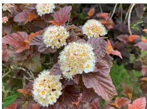
⑯ Physocarpus opulifolius cv. cantoniensis . Flowers are similar to Spiraea cantoniensis . Our gardens have 3 varieties of copper leaves.