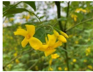
⑤ Jasminum humile var. revolutum A flowering tree native to the Himalayas. A member of the Jasmine family, but not very fragrant.