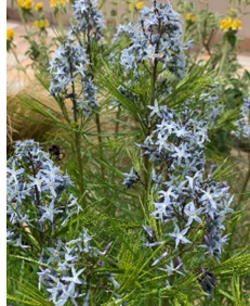
②⑤ Amsonia hubrichtii Lodging plants with beautiful yellow leaves.