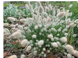
③⑩ Lagurus ovatus 'Rabbit Tail Grass' Ears look like bunny's tail. Annual grass.