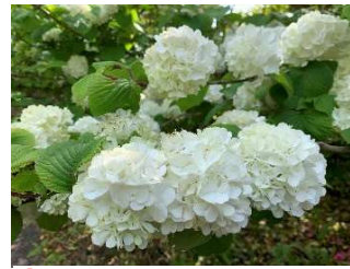
⑥ Viburnum plicatum var. plicatum f. plicatum Horticultural varieties of Viburnum plicatum var. tomentosum . Flowers are almost the same as Viburnum opulus 'Snowball'.