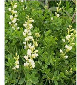
②⑧ Baptisia 'Vanilla Cream'