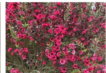
⑮ Leptospermum scoparium Australian and NZ native flower plant. Manuka honey nectar source.