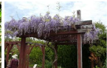
⑲ Wisteria floribunda We have a small wisteria trellis in Horticultural Therapy Garden.