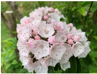
④ Kalmia latifolia A shrub of the Ericaceae family native to North America. The buds are cute flowers resembling konpeito (small colored sugar candy) and Apollo chocolates.