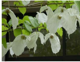
② Davidia involucrata Native to Sichuan and Yunnan, China. Flowers bloom like hanging white handkerchiefs. until early.