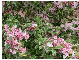
⑩ Weigela florida 'Variegata' A garden cultivar with mottled fringes on its leaves.