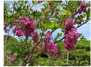
③ Robinia hispida It is a member of locust ( Robinia pseudoacacia ), but it is a shrub of about 3 m and has pink flowers.