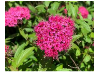
⑦ Spiraea japonica Common shrubs in gardens and parks. Flowers are red or white, and Genpei specie bloom both.