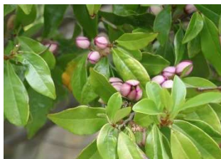
⑰ Magnolia figo Evergreen Magnolia family. Small flowers have banana-like fragrance.