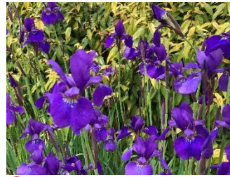
②② Iris sibirica cv. Horticultural varieties of the lineage of Iris sibirica . Early blooming and tall.