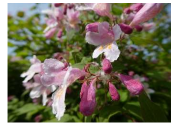
⑪ Kolkwitzia amabilis The long white thread-like thing on the stem of the flower.