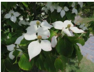
⑧ Cornus kousa It grows naturally in the fields and mountains of Japan. The white petals look like bracts.