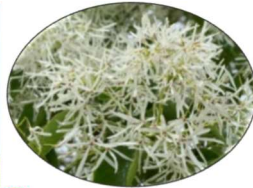
① Chionanthus retusus Also called 「Nanjamonjanoki」. There are male and hermaphroditic strains, and our school has one of each.