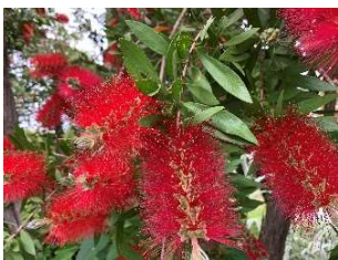
⑫ Callistemon speciosus Also called 「Scarlet Bottlebrush」. Flowers are red or cream. Native to Australia. It is also called 「Brush Tree」. because it resembles a brush.