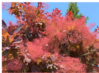
⑬ Cotinus coggygria Also called 「Smoke Tree」. What look like smoke are not flowers but hair attaching with flower stems of sterile flower. There are red, pink, and white.