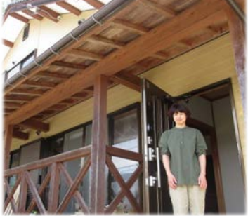
Experience of traditional style weaving in a rural house, Oct. 5th (Sat)