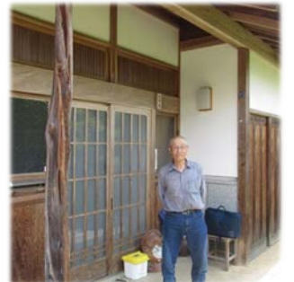
Experience of drawing traditional message card in a rural house, Oct. 6th (Sun)