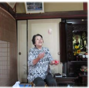
Experience of making and playing with Japanese toy 'Otedama', Nov. 24th (Sun)