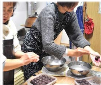
Experience of cooking and tasting traditional food in a rural house, Oct. 26th (Sat)