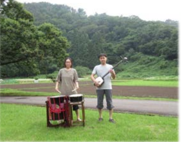
Experience of playing Japanese traditional musical instruments, Oct. 27th (Sun)